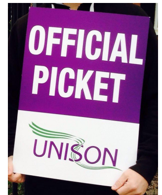
Meeting Dates—March 2015

"Barnet Council staff are an incredible, resourceful & understanding workforce, who have been subjected to unacceptable levels of change and stress. The adoption of the five commissioning outsourcing projects makes it very clear to all staff that the Council is not interested in retaining in-house services. This is an ideological assault on public services and our branch is drawing a line in the sand by declaring this ballot. Austerity politics is driving an anti-in-house services agenda which we reject and are asking our members to reject."