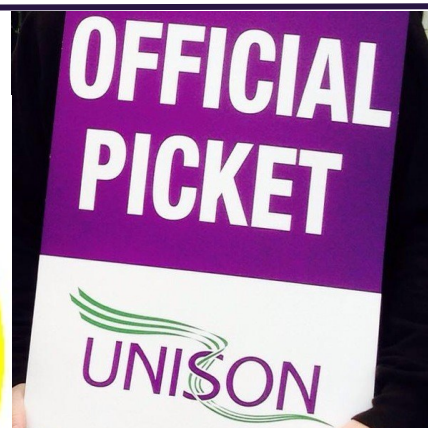
Meeting Dates—March 2015