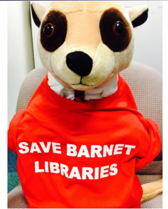
Meeting Dates—November 2014